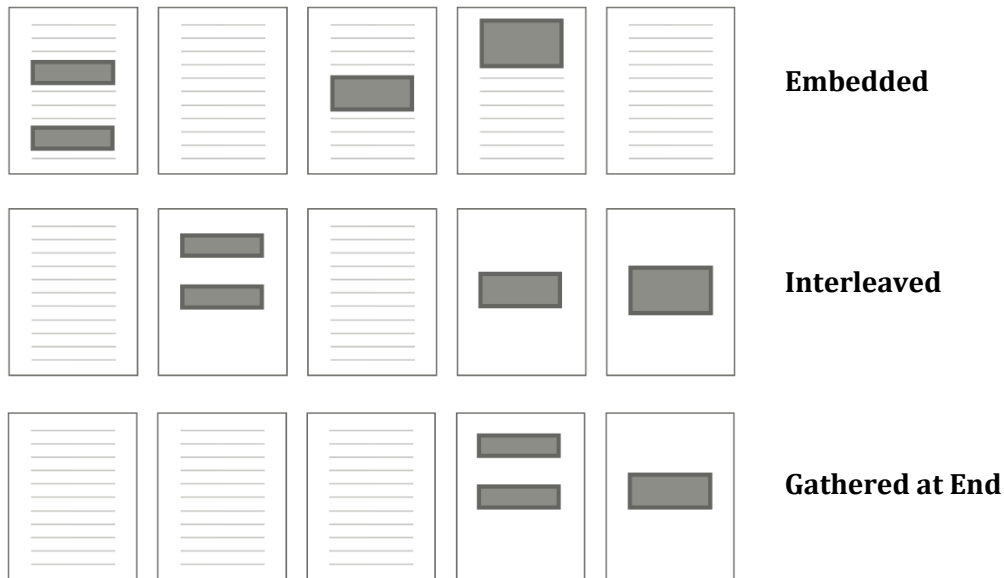
Figure 1. Three options for figure/table placement. This figure depicts the three acceptable options for placing tables and figures in your thesis. Choose one option and use it consistently throughout.